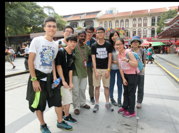
Singapore field trip