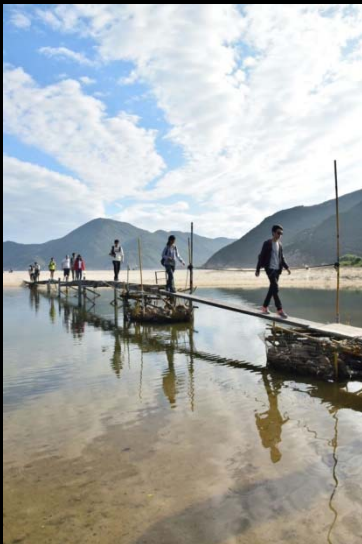
Field trip of HK flora and vegetation

In my life of studying in CUHK, my favorite Biology courses are the Biodiversity Lab and the Hong Kong Flora and Vegetation. I love these courses because, rather than just having the lecture, they offered us a fresh and interesting way to learn - observing live specimens, dissecting animals and flowers, and investigating plants during field trips by using sight, smell, touch and even taste! They really enriched my knowledge about plants and animals.